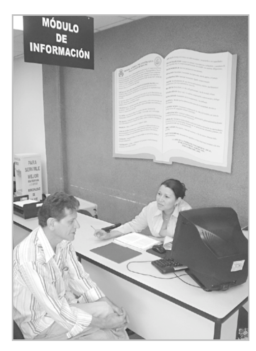
The Earth Charter of the local government of the city of San Jose

sustainable development issues, the meaning of the principles of the Earth Charter, and their application within public institutions. A comparative analysis of the Municipality policies against the values and principles of the Earth Charter demonstrated considerable gaps between the two. The democratic nature of the project allowed the municipal workers involved to not only internalize the values of the Earth Charter personally but also to incorporate them into the strategic planning process of the city.